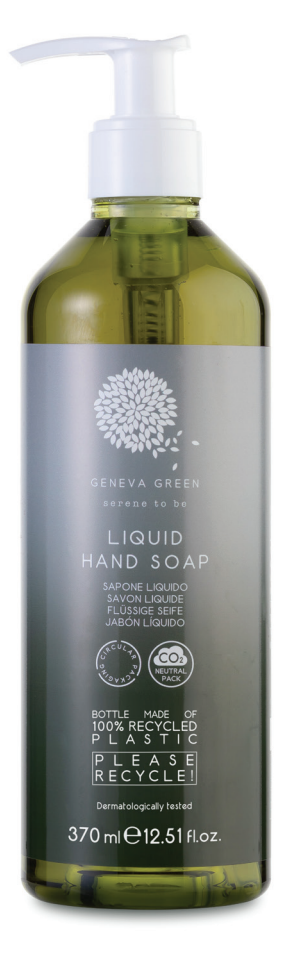
LIQUID HAND SOAP 370ml RGP350LMGR CT/18

After use recyclable plastic is broken down into reusable flakes of plastic which can be reformed and reused indefinitely with careful manufacturing in a circular economy model that aims to create value from waste.